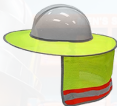
BRIMMED SUN PROTECTOR FOR HARD HAT