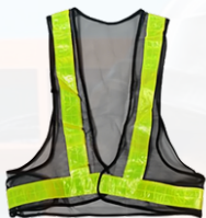
UNIVERSAL SAFETY VEST